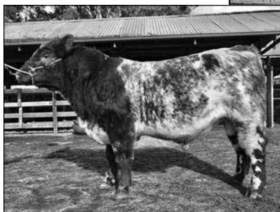
SIRE: CASKIEBEN CONDRAMINE M59