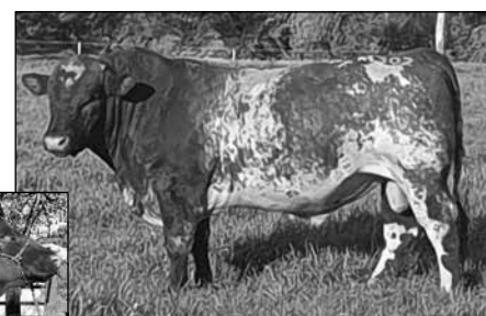
SIRE: OUTBACK SPRYS BUDDY M302