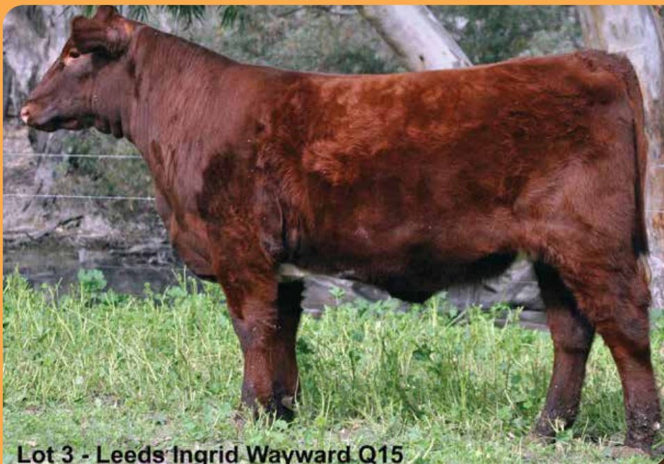
Lot 3 - Leeds Ingrid Wayward Q15